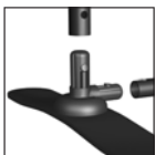
"Express Connect" Snap-and-Lock Foot System