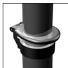
DownStop Lock to adjust height from 53" to 94"